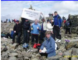
Above: At the top of Ben Nevis

On a hot summer's day members, friends and family of Dunoon's Community Mental Health team fulfilled a life-time ambition and climbed the UK's biggest mountain, the 'Big Ben'.