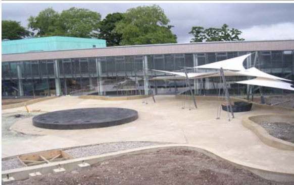
Above: The courtyard under construction