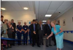
Above: The ribbon cutting

The new unit is the third phase in a £3m investment in the hospital and includes a recovery room, treatment and observation room, new x-ray equipment, out of hours consulting rooms, crash room and a place of safety room.