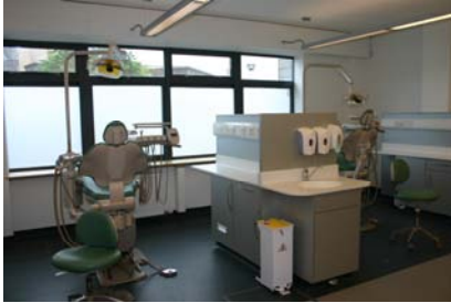
Above: the polyclinic

This facility will aid retention and recruitment of all dental professionals which will lead to improved patient care and access to dental services.