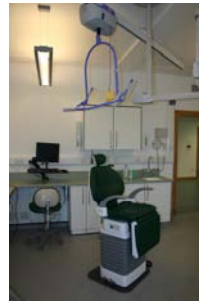
Above: dental chair complete with hoist

Decontamination Unit), one of which will have a training role and can broadcast sessions