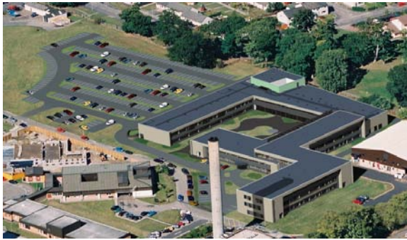
Above: Artists impression of the centre

The Centre for Health Science is probably the first of its kind in the UK bringing together the public, private and academic sectors in healthcare and biotechnology.