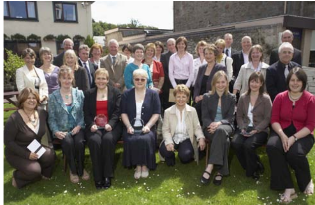
Above: Last years winners