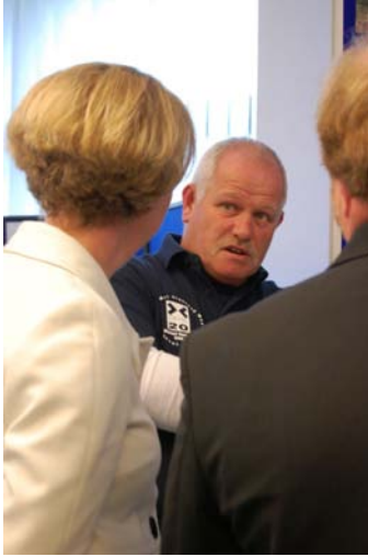
Above: Apex Scotland meet the Minister

Health Minister Shona Robison was introduced to health staff developing brief interventions for risky drinking and met staff and volunteers from a range of agencies involved in treating and preventing alcohol problems including Apex Scotland, Beechwood, Terence Higgins Trust, Highland Drug and Alcohol Action Team, and Health Promoting Schools.