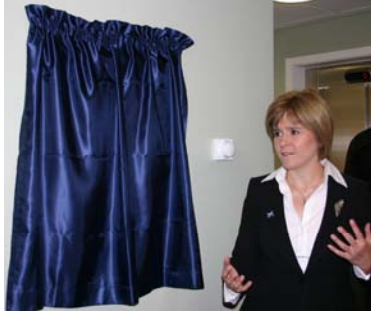
Above: Nicola Sturgeon before the unveiling of the plaque

The new Lochalsh Healthcare Centre was officially opened by Deputy First Minister and Cabinet Secretary for Health and Wellbeing Nicola Sturgeon on 26 August.