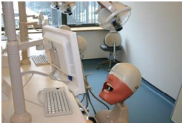
Above: a 'phantom head'

have a wider remit of clinical duties than Hygienists and will undertake routine dental work.