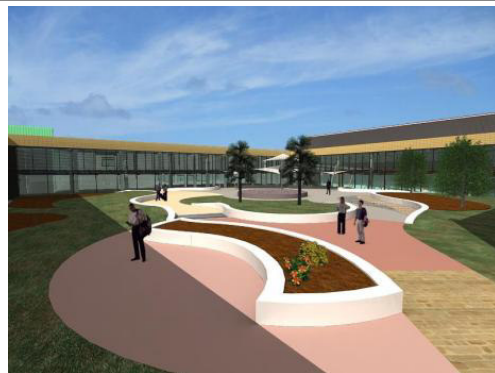
Above: An artists impression of the finished courtyard