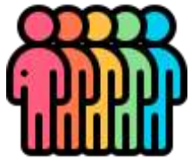
Current Population Profile