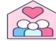
Care At Home