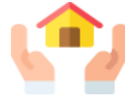
Alternative Housing 69 units